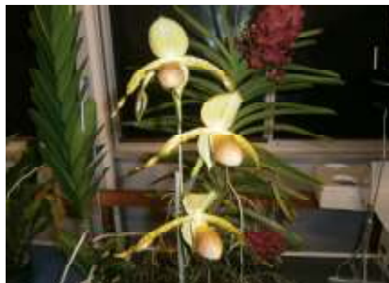
Paph. Imperial Jade