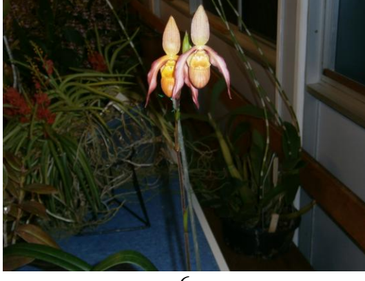
Phrag. Olaf Grubb X P. sargentianum

Please check your plant names & registrations before benching. ED