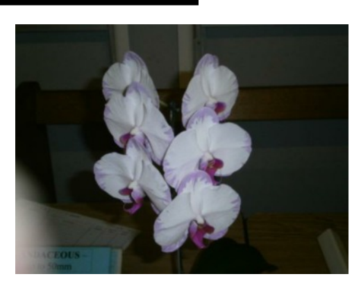
Dtps. Lighting 'New Lighten'