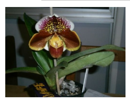
Paph. British Bulldog