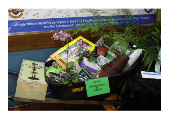
First Prize – Show Raffle Prize (above)