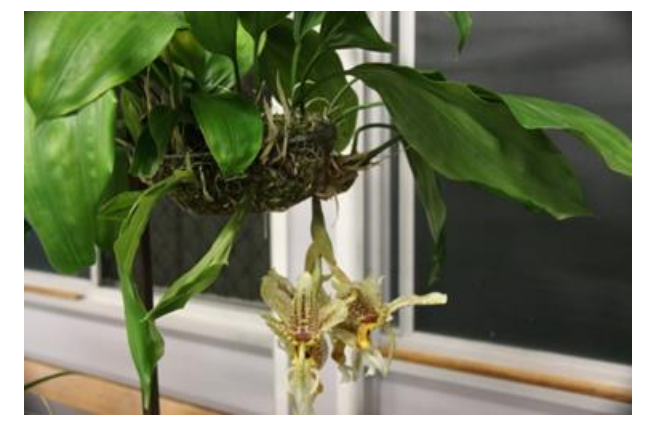
< Stanhopea aurata