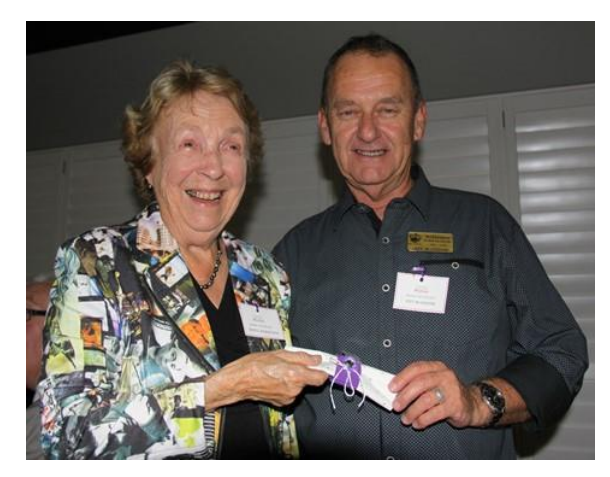
Passing of the baton????