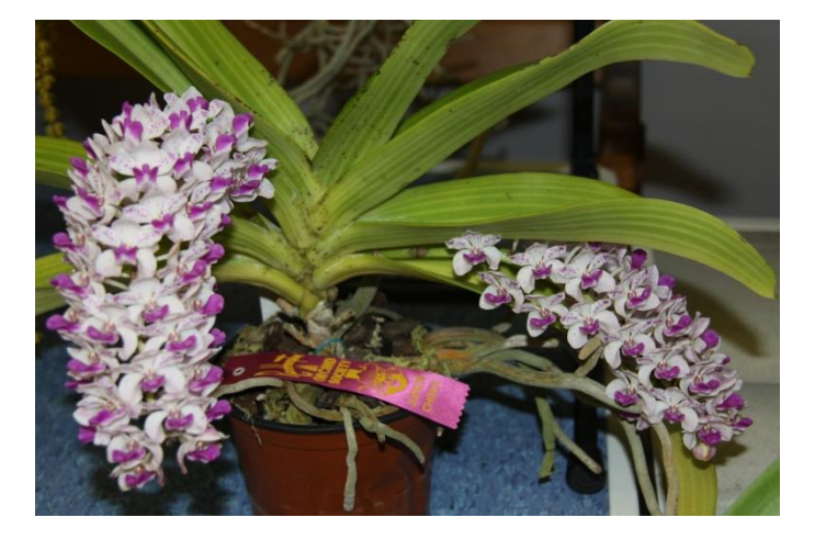
Rhy. gigantea - B & N Lakey