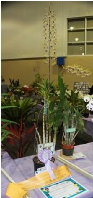
< Reserve Champion (Sorry I don't have the name)