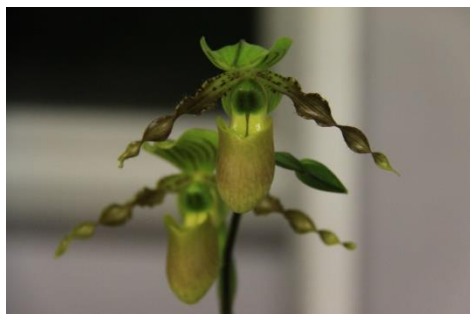
< Paph. Prim 'n Proper – B & H Hilse